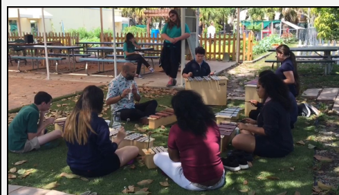
Music students practiced in the EDU-Garden, to the delight of the EDU-Garden staff, students, and chickens!

If you know some one in South Carolina in the Columbia or Charleston area, please direct them to this link tinyurl.com/bfa4sc , and help bring BFA to South Carolina.