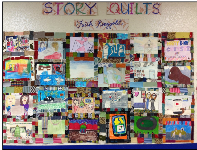
Class Collaboration Hallway Display